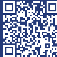
Car & Commercial Plan Booklet

For a full breakdown of the components considered for our repair plans, scan the QR codes below, or ask your dealer for details.